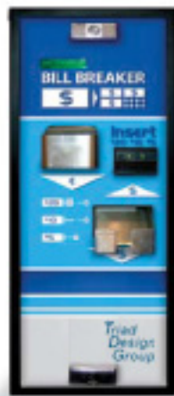
500C2-1 (shown) 500-1, 500C1-1