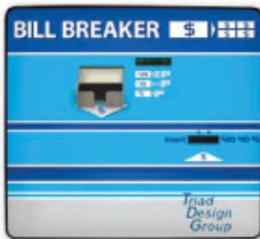
500RL-2 (shown), 500RL-1