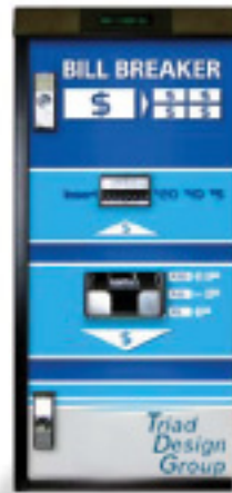
500C1-2 (shown) 500C1-2, 500C2-2